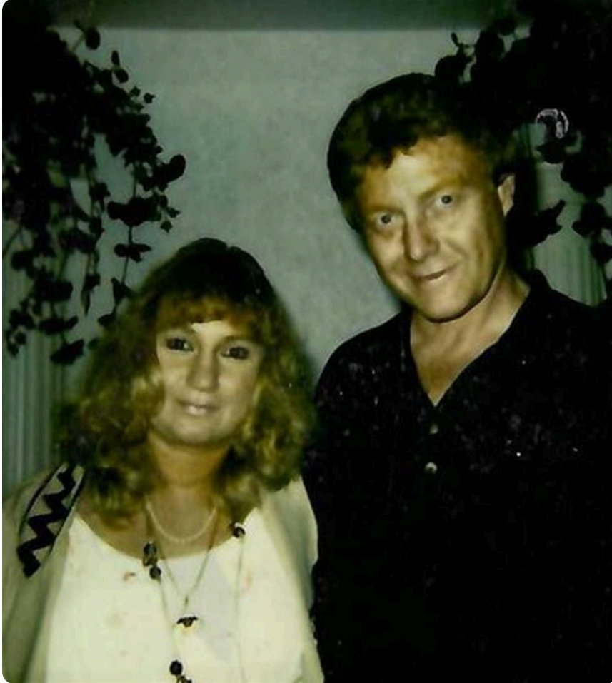
New Photo 1